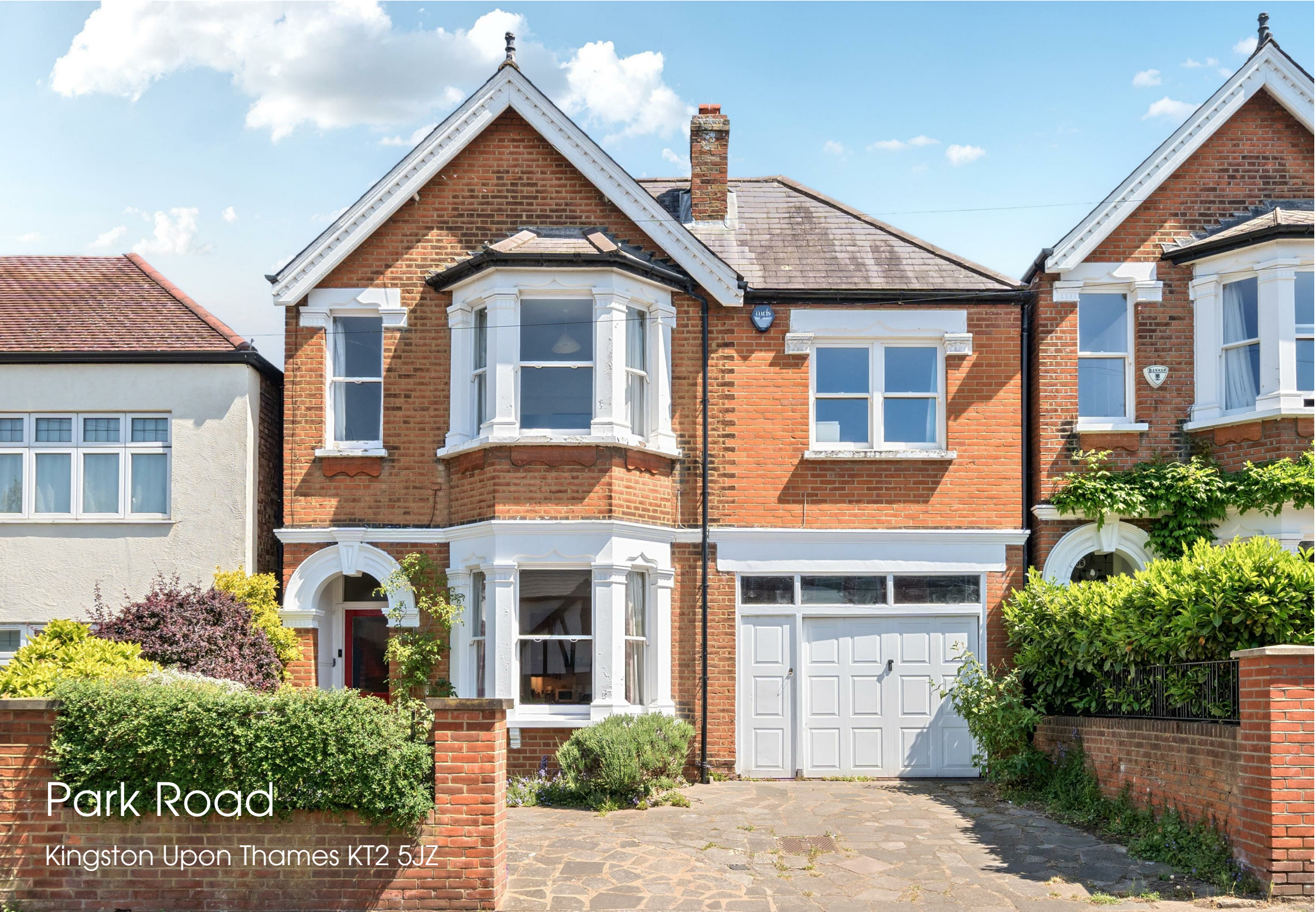
Park Road Kingston Upon Thames KT2 5JZ